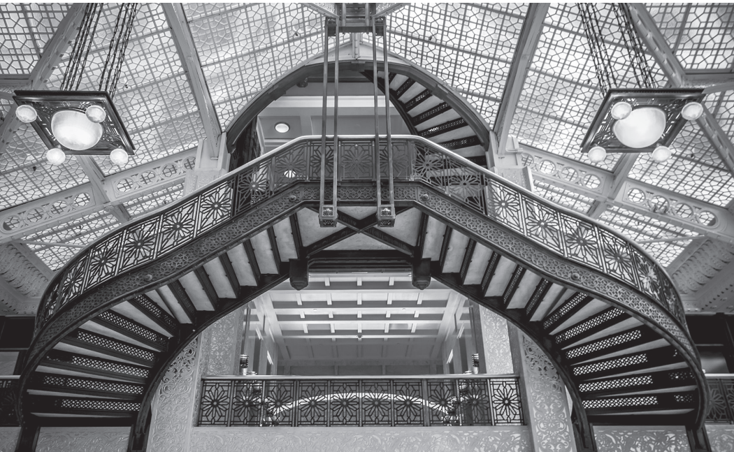
The Rockery by Frank Lloyd Wright.

Clif Bar & Company's new industrial bakery in Idaho will have large projections of pictures of their customers in the outdoors to bring nature into spaces that are otherwise windowless and sterile by necessity. In the non-food production spaces, a more direct connection to nature will be established by water features, stone walls, and views to