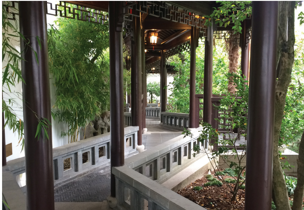
Lan Su Chinese Garden

Green building efforts traditionally focus on costs of energy, water, and healthy materials—all important topics. Yet, human costs are 112 times greater than energy costs in the workplace (Browning, et al., 2012). Incorporating nature into the built environment is not a luxury, but a sound economic investment in health and productivity. Biophilic design has been shown to improve employee well-being, increase