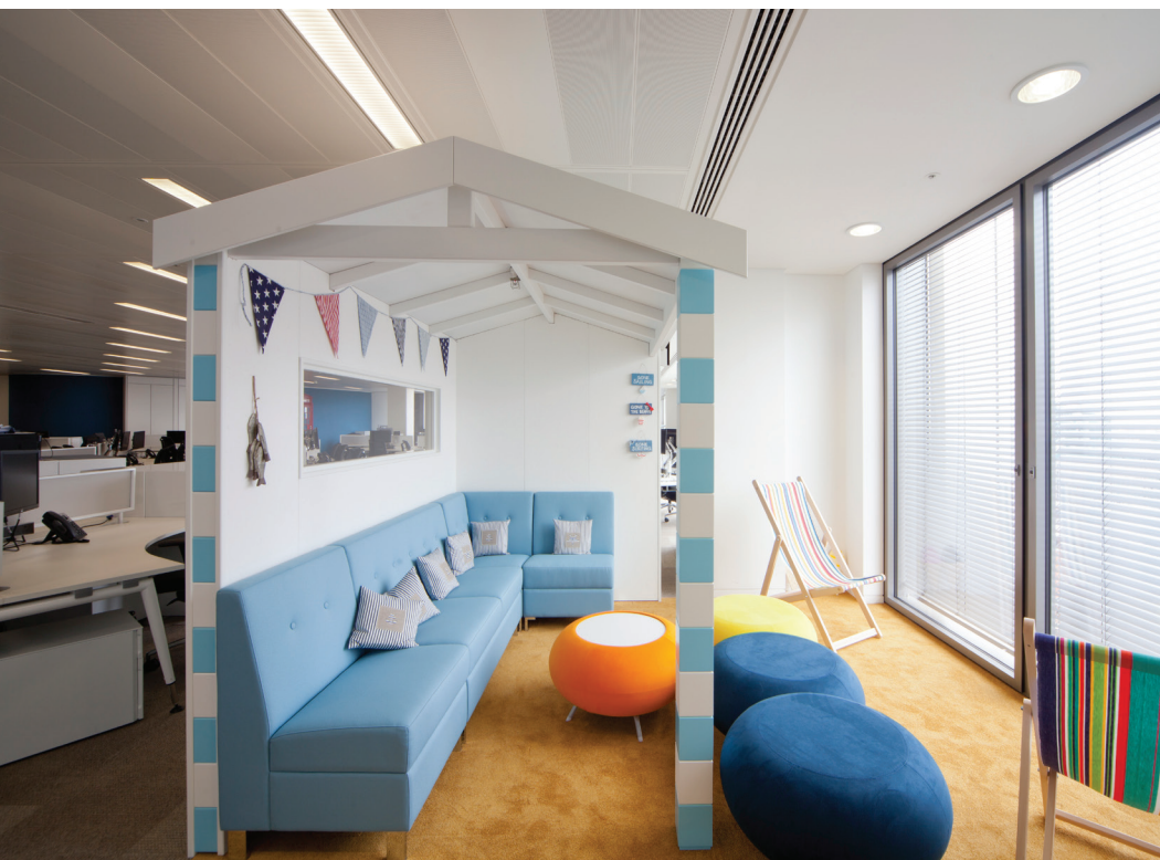
Harvey Nash office space by K2 Space