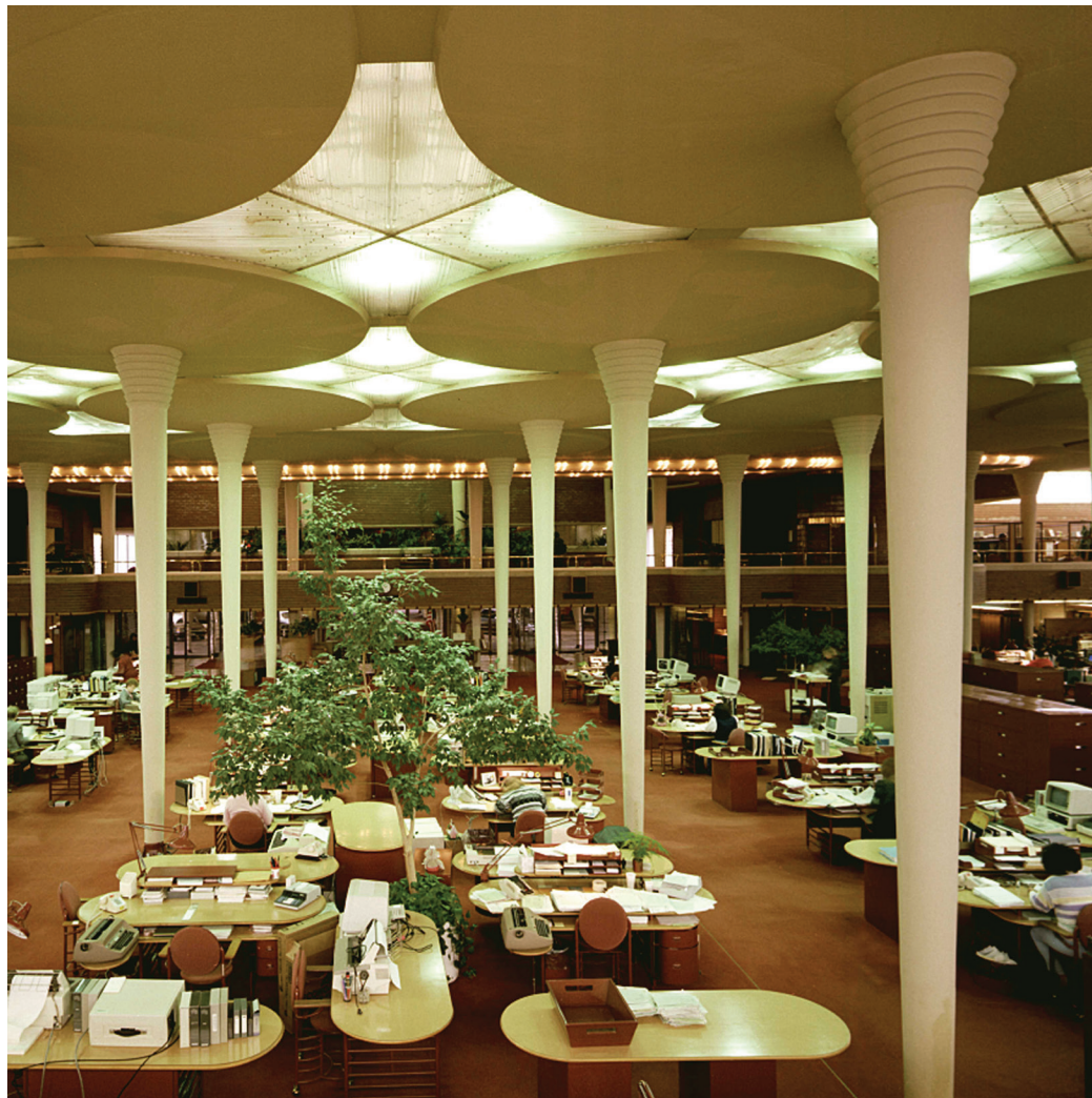
SC Johnson Administration Building, Great Workroom